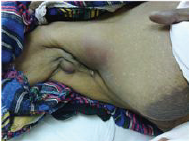
Fig. 1. Picture of right breast tail showing three lumps ranging in size 4-2 cm, associated with redness of the largest (4 x 3) cm mass.

The findings at physical examination showed normal vital signs and three mildly tender lumps in the right breast tail ranging in size from 2-4 cm, associated with hotness and redness. The lumps were not fixed to skin or chest wall; however, there was an area of fluctuation within the lumps. Otherwise, the lumps were firm with no opening sinuses neither lymphadenopathy (Fig. 1). Examination of the contra lateral breast was unremarkable.